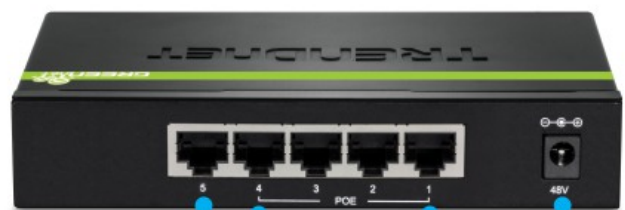
1 x Gigabit port 4 x Gigabit PoE+ ports Power