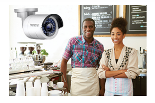
PoE Camera Flexibility Automatically supply up to 15.4 Watts to standard 802.3af PoE devices.