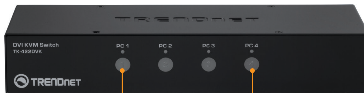
PC selector buttons