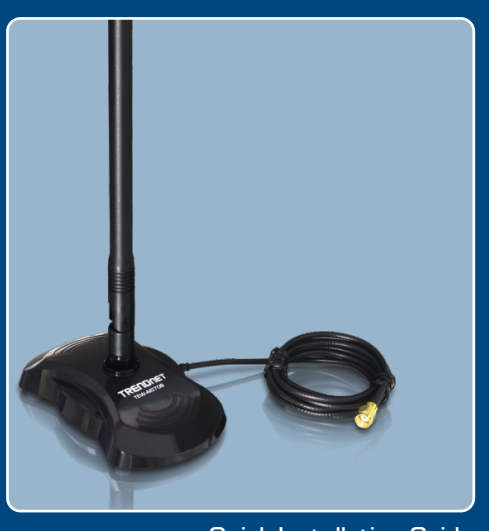
Quick Installation Guide